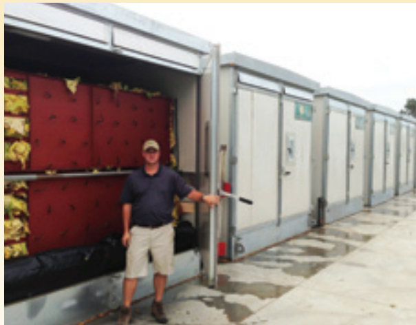
Steve Evans Farms