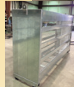
New World Tobacco Galvanized Boxes

World Tobacco, Inc. Tobacco Kilns (Barns) are the world class standard in quality tobacco curing: